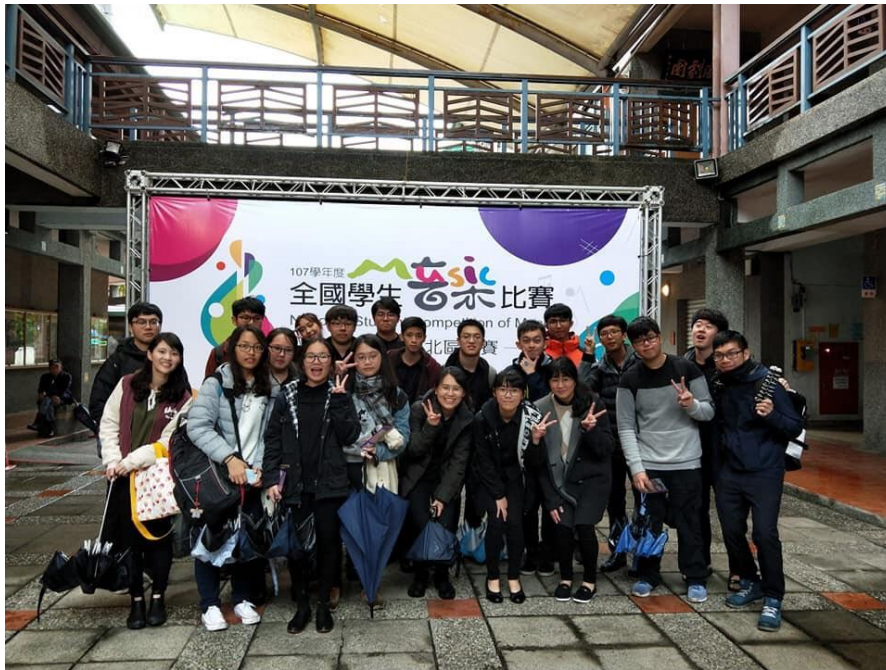
Tamkang University Student Association was awarded “2019 National Student Competition of Music” National music Group B “Cum Laude”.